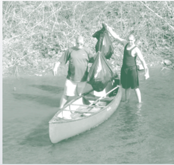
Two of the more than 150 volunteers recover trash from the Brandywine.

This year the collected trash amounted to less than a dumpster full for the 25 miles that were cleaned. In addition, only 30 tires were collected for recycling. The clean-up was sponsored by Arcelor Mittal and the United Steelworkers, PECO, Aqua Pennsylvania, and Penn American Water Company. Also supporting the clean-up were Northbrook Canoe Company, Hickory House Catering, Starbucks Coffee Company, Allied Waste and the Southeastern Chester County Refuse Authority. Over 150 volunteers took part in the clean-up which covered the east branch from Downingtown, the west branch from Coatesville and the main stem to Route 926. Volunteers came from Allied Waste, Sikorsky Global Helicopter, Westminster Presbyterian Church, QVC, Boy Scout Troop 52, Venture Crew 543, Henderson High School Ecology Club, and students from Kennett High School.